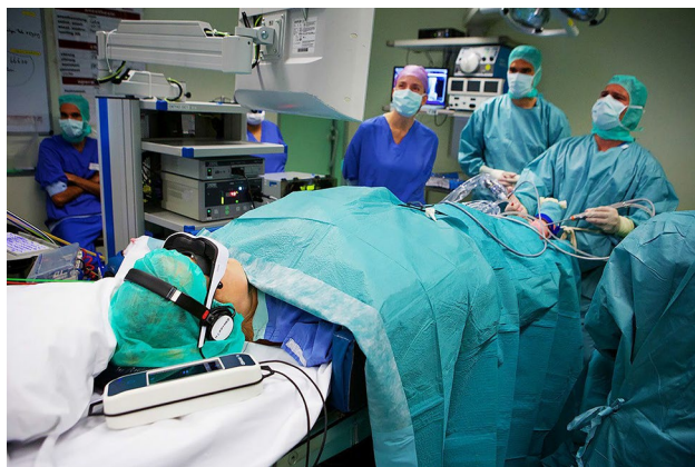
Fig. 1 Patient undergoing surgery wearing the ‘HappyMed®’ AVD system in the operating room. Photo taken with consent of all involved

the intervention was not interrupted. Any interruptions were documented. The intervention was initiated after time-out procedure and immediately before surgery started. Systems were activated before the first incision and deactivated after dressings were applied to the wounds, just before sign-out.